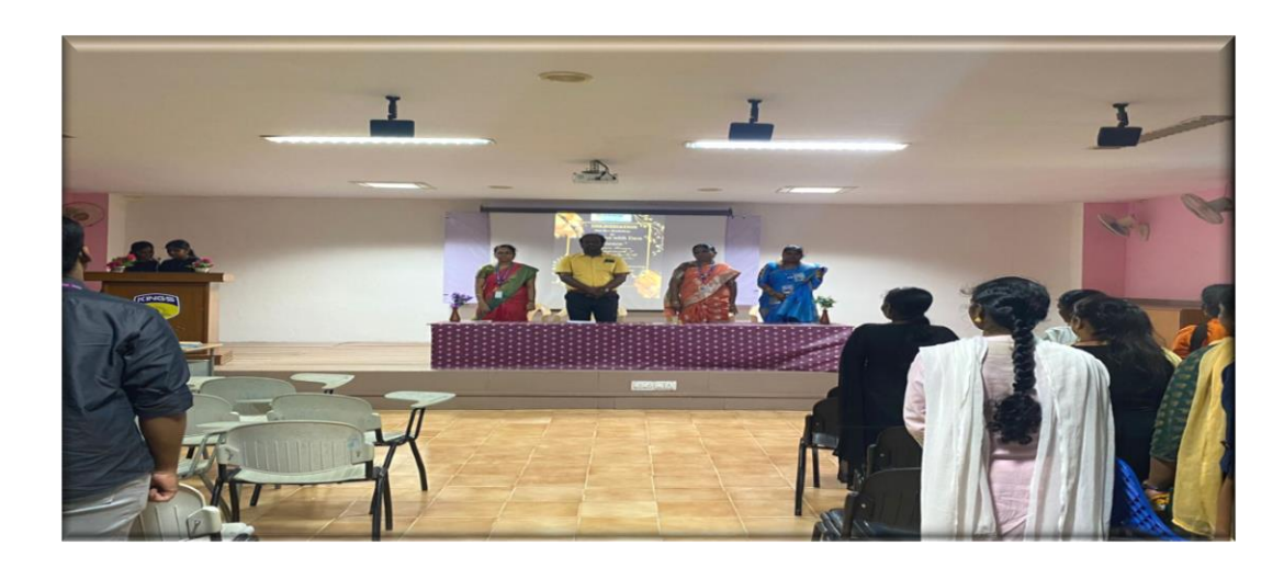
WORKSHOP INAGURAL SESSION

In addition to this, he also explained about the concepts of using Python pandas & Data Analysis, which was very well understood by the participants. The workshop was conducted in two sessions. Morning session involved the resource person presentation. In the afternoon session practical classes took place and queries from participants were clarified. Finally one Quiz competition was also conducted by coordinators through KAHOOT app, regarding the workshop content to analyze the student understanding about the workshop.