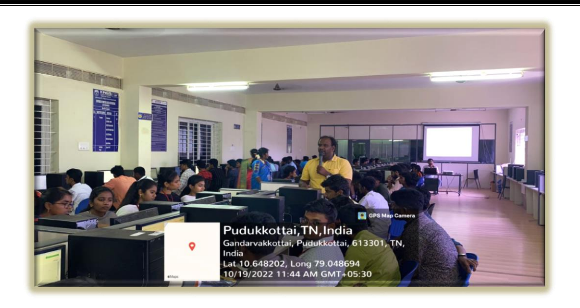
PRACTICAL SESSION ON FORECASTING MODEL IN DATASCIENCE -CSE LAB -1