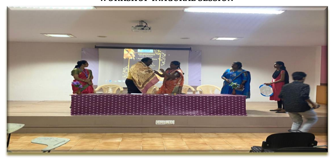
HONOURING RESOURCE PERSON BY HOD OF CSE