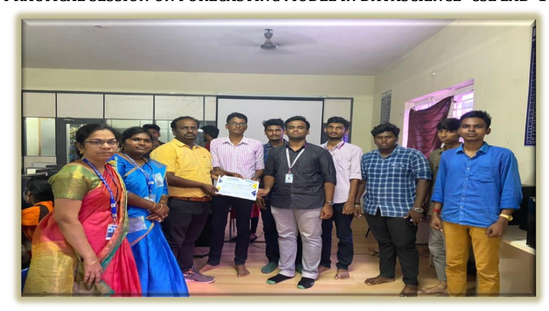
CERTIFICATE DISTRIBUTION IN GREAT MANNER