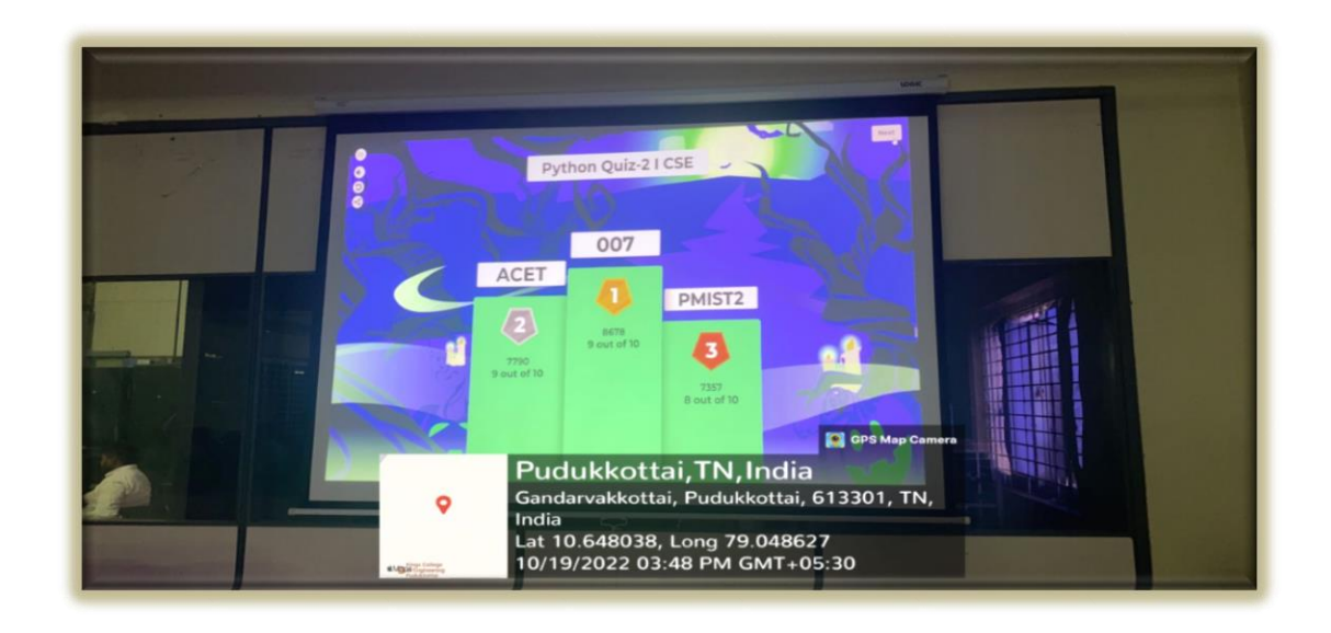
DISPLAY OF QUIZ RESULTS