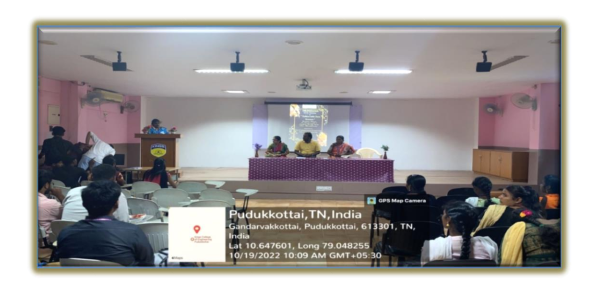
INTRODUCING THE RESOURCE PERSON