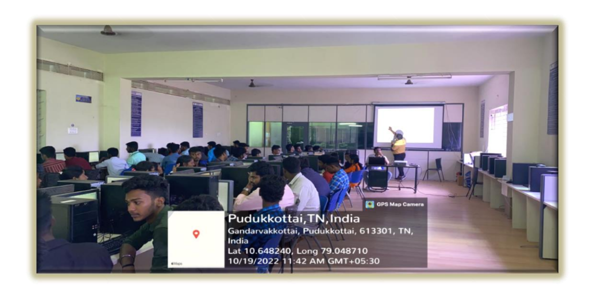
PRACTICAL SESSION FOR DATASCIENCE CONCEPT